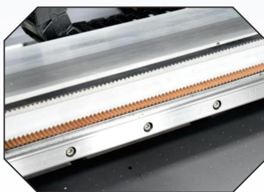
Hiwin guide rail