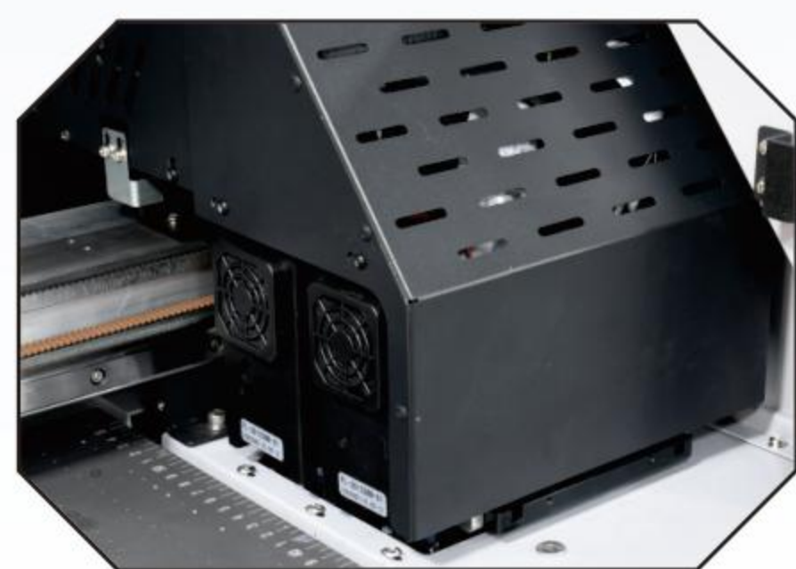
Air cooling system