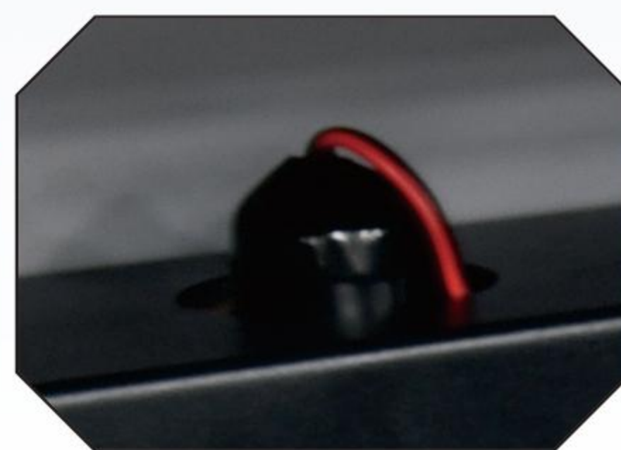
White ink stirring motor